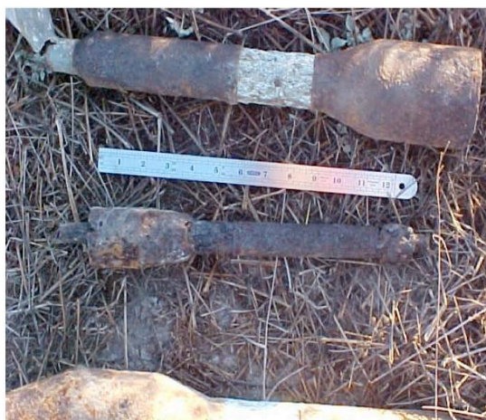
Inert 3.5 and 2.36 inch rockets recovered from site.