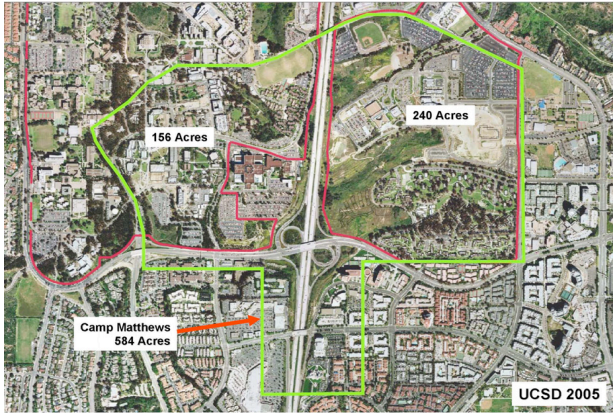
Camp Matthews FUDS area, approximately 400 acres, overlaid on an aerial map of UCSD in 2005.

For more information about UCSD's Soils Management Policy and Ammunitions Awareness program, contact: