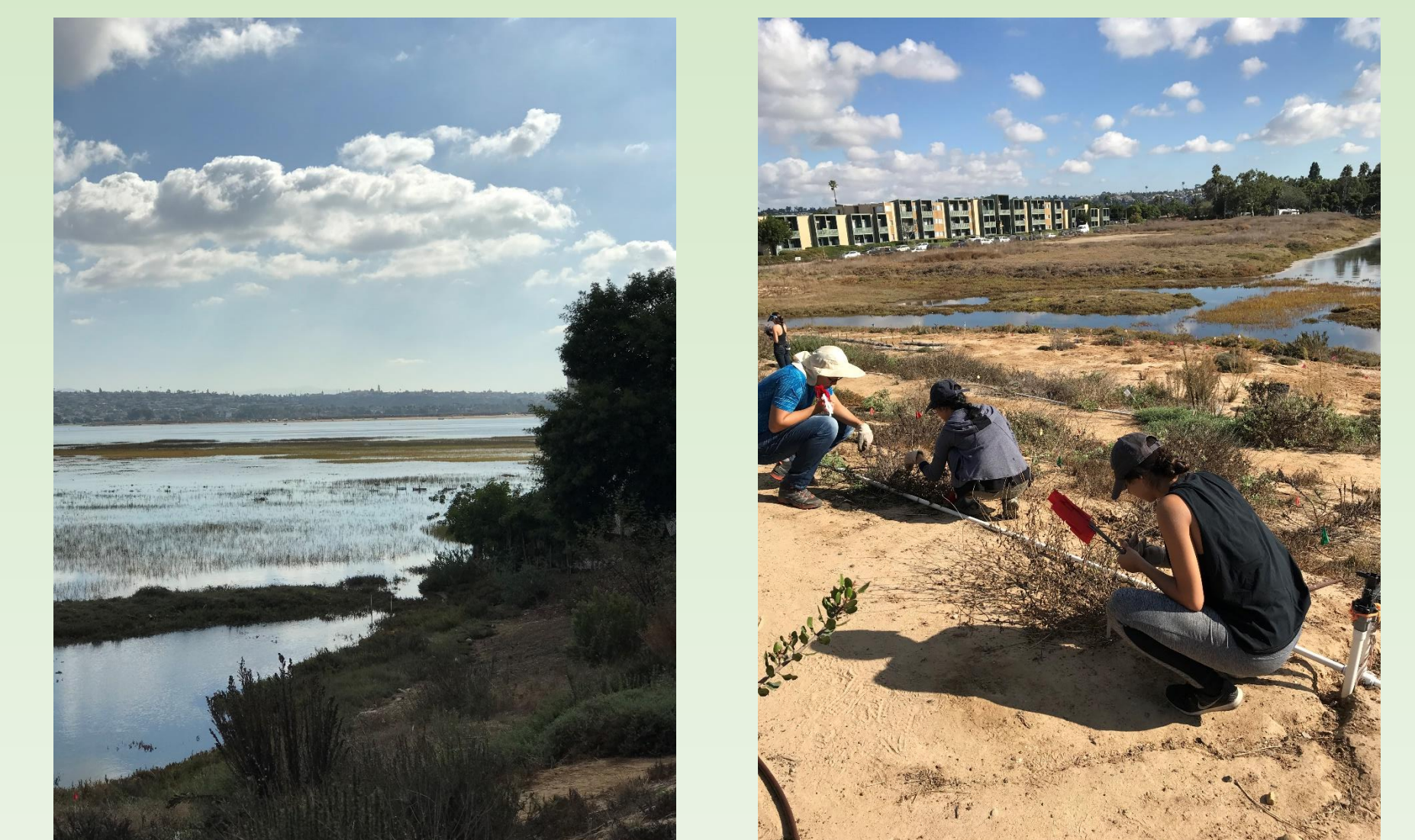
The image on the left is a photograph of Kendall Frost Marsh during a high tide. The image on the right is an image of myself during a volunteer work party, examining a species. As mentioned in the conclusion, during work parties volunteers can help apply salt water to invasive species that cover a large area.