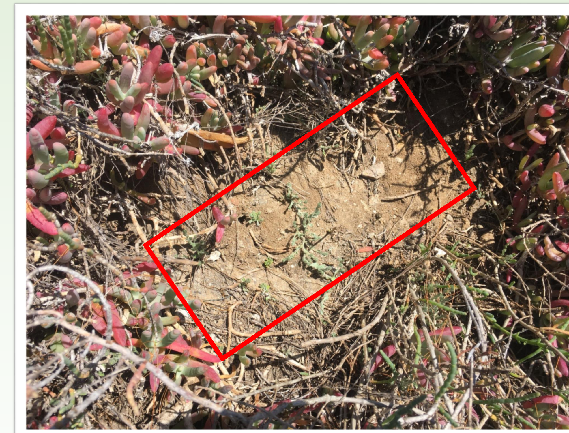
The image on the left was the original photo of plot number 4. Plot 4 was located on the slope of the knoll, closest to a marsh channel. It was one of the plots that received the salt water treatment and originally had the only species of ice plant growing. After the 5 weeks of treatment, a different species grew in the bare ground. The image on the right shows the bare ground area with the new plant species. This species was mainly growing in the plots that were located on the same slope of the knoll. The percent coverage of this area was calculated by using a grid that summed to 100%. Plot 4 and 9 had the greatest percent coverage in the bare ground compared to the other plots.